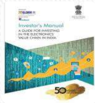
Investor's Manual (A Guide for Investing in the Electronics Value)