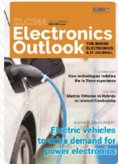
ELCINA Electronic Outlook (6 Issues Yearly)