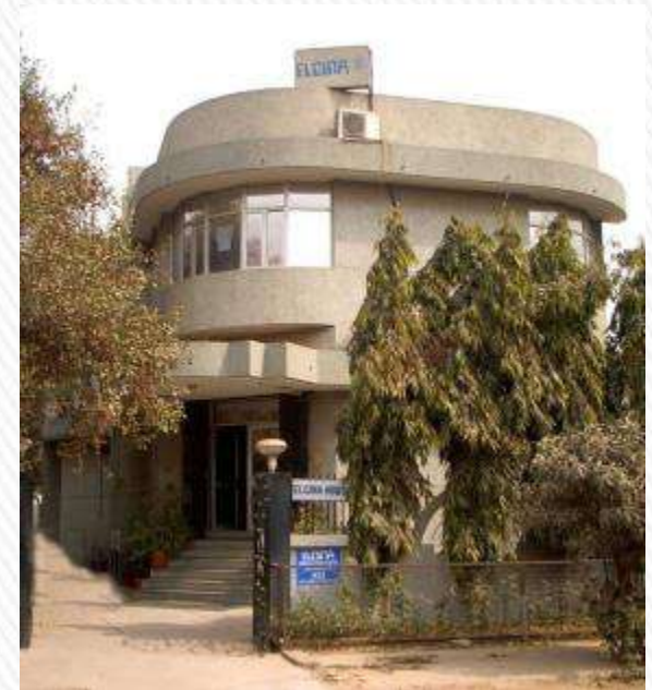
ELCINA House, New Delhi