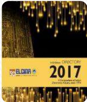
Directory of Indian Electronic Industries