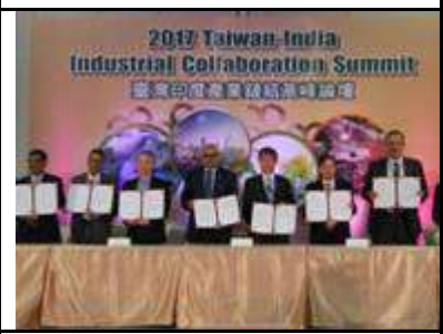
MoU signed between ELCINA and TEEMA at the 2017 Taiwan-India Industrial Collaboration Summit at TAITRONICS