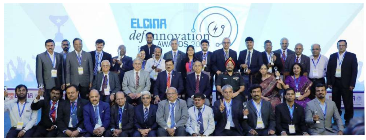
Winners of defEnnovation Awards 2018

ELCINA defEnnovation Awards 2018 was held during the Strategic Electronics Summit 2018. The awards aimed to recognize outstanding companies who have made exemplary contribution in the field of Defence & Aerospace Electronics innovation (R&D, design and Manufacturing).